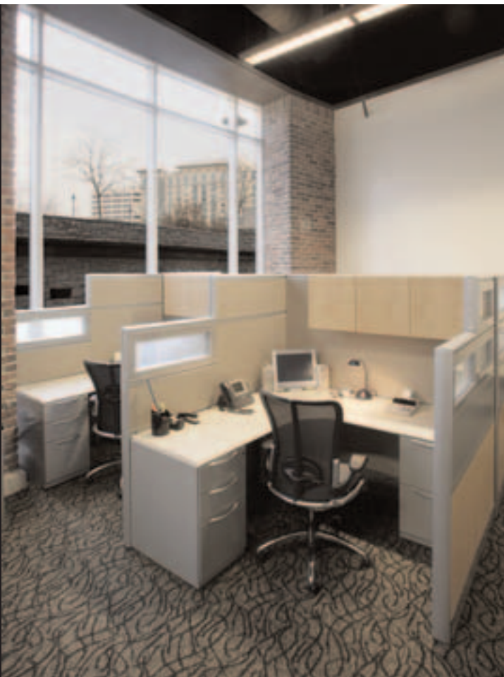
Xsite’s ability to expand and contract its structure in 3-inch increments allows for a perfect fit between building columns.

“...ability to maintain design consistency...”