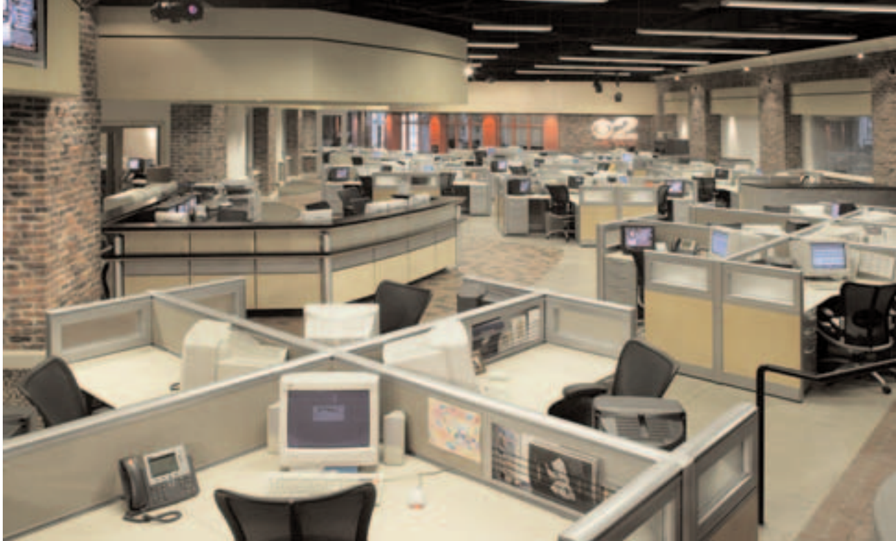
Xsite's wood, steel and glass aesthetic complements the brick and cobblestone architecture, while handling the station's substantial power and data requirements with ease.