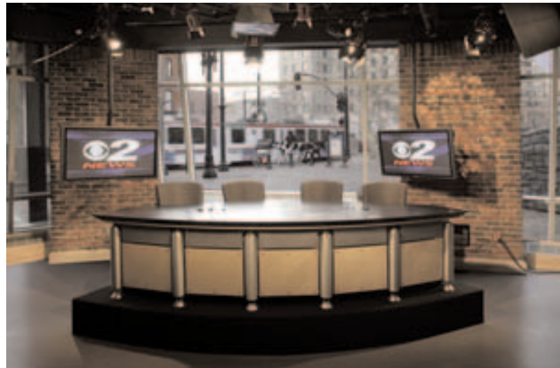
For local news segments, the By Design custom news desk anchors the panoramic view of downtown Salt lake City.

The new facility builds on the station's "Fresh Air" image of personalized newscasts that reach out to viewers. "It's an environment that acts and reacts the way our newscasts have over the last few years," Phillips says. "It lets the people of Salt Lake be a part of our newscast and allows us to be a part of their lives every day."